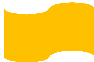
The Color Yellow