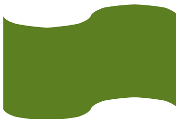
The Color Green