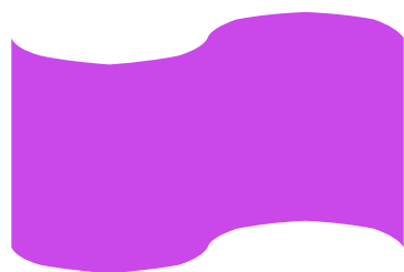
The Color Purple

The natural environment is full of beautiful colors, shapes and patterns. As you explore your natural environment look for the following. What colors, shapes and patterns can you find in nature?